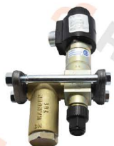
HS8A Solenoid Valve