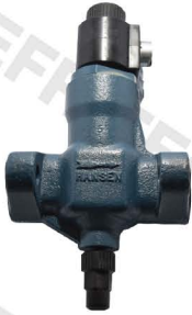
HS7 Solenoid Valve