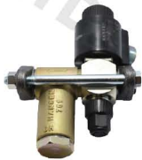
HS6 Solenoid Valve