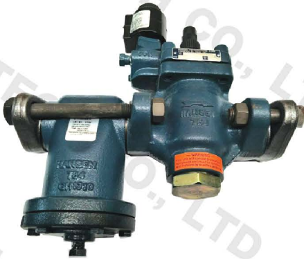
HS4A Solenoid Valves